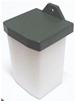
LIGHT SENSOR ( LWJ88LS ) 感光器